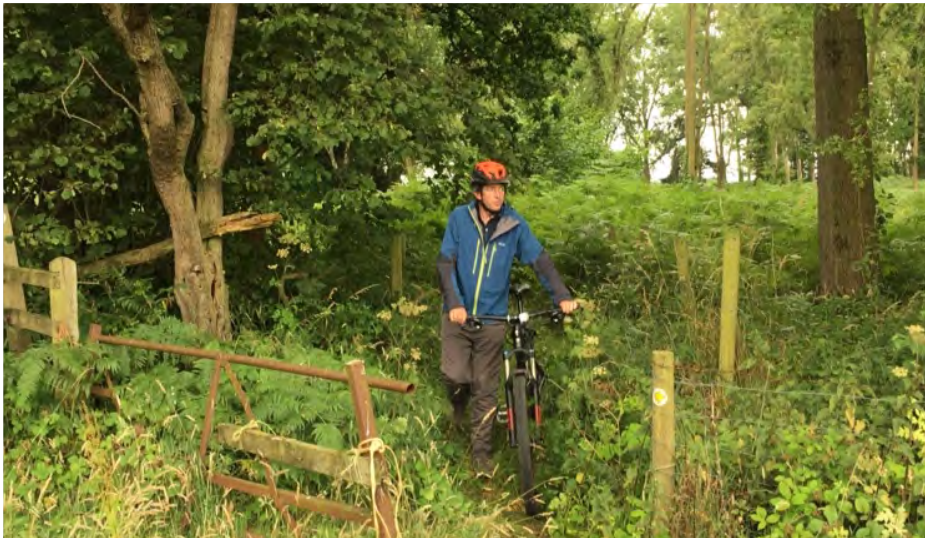
'Daily Exercise' checking out the footpaths and cycleways in Tern during lockdown