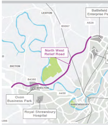
The NWRR needs to be done right to integrate transport, flood risks and a new town centre

In Tern we have villages affected by inappropriate traffic on 'rat-runs' through the countryside and The Shrewsbury Big Town Plan will pedestrianise north-south roads so something is needed. But there are fears that the NWRR will lead to infill housing blighting villages. Many new houses are already approved but we can influence how they integrate into our villages. The NWRR could contribute to a greener new town centre with a leisure and hospitality economy – if we get it right!